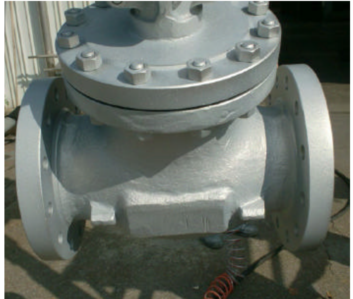
HYDROTHERM ® 600 (Fig.3)

The next step was to formulate a waterborne silicone product that could be applied in a single coat with quick drying time, which could still operate in temperatures up to 600°C. This represents the latest development required by the most common international standards. After considerable research by Division LABORIS, TiPiCi entered the market with a third waterborne silicone paint called HYDROTHERM ® 600 (Fig.3), which has found interesting uses in the valves and flow-control market sectors.