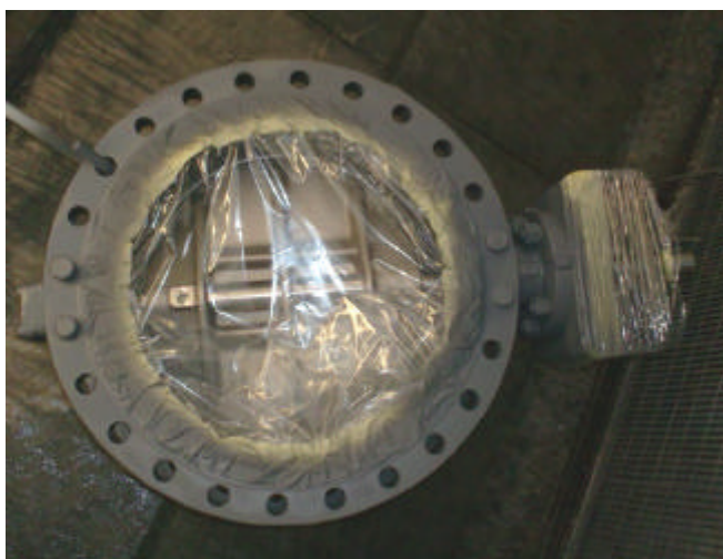
HYDROTHERM® 400 Primer (Fig.1)