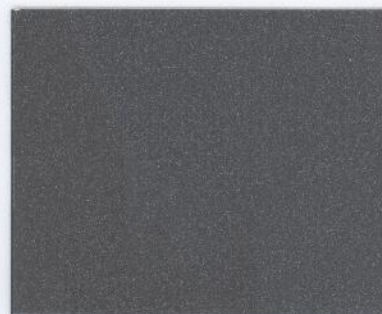
Dark Grey – cod. 100764