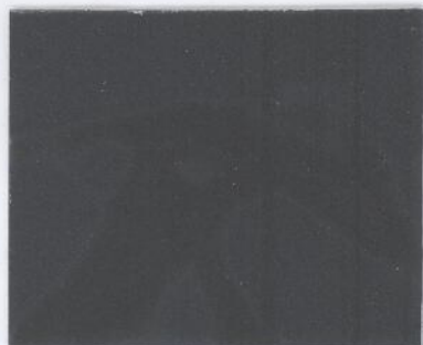
Black – cod. 100800