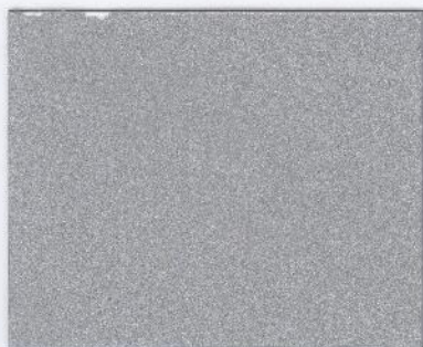
Aluminium – cod. 100799