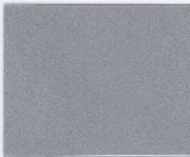
Grey White – cod. 100030