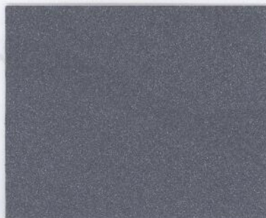
Blue – cod. 100801